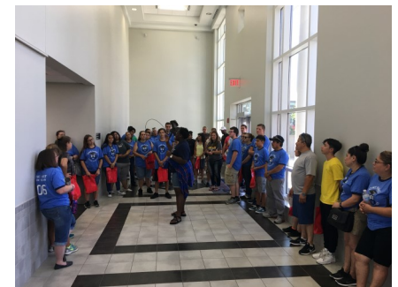
Students touring Rogers State University.