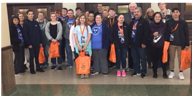
Students tour Oklahoma State University.