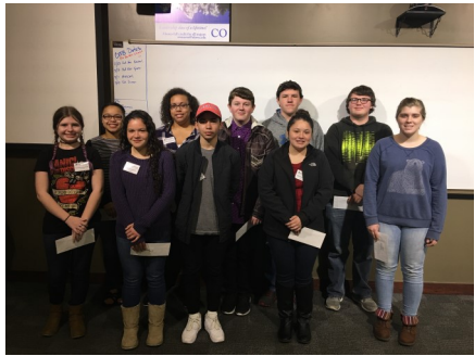
Students who had perfect attendance at all LFYS Program events in 2017.