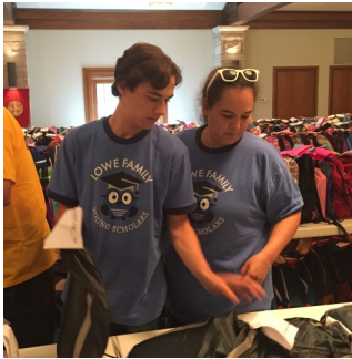
Students & parents volunteering.