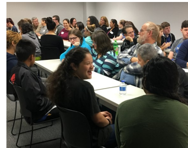
Teambuilding at Quarterly Meeting.