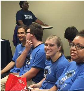
Students enjoyed tour of RSU Claremore in July.